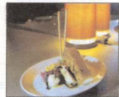
Vanilla Room on Norton St in Leichhardt.

Where: 153 Norton St, Leichhardt When: Seven days, 6pm to midnight How much: From about $8 to $18 each course Bookings: 9569 9411